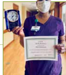
The Village at Pine Valley