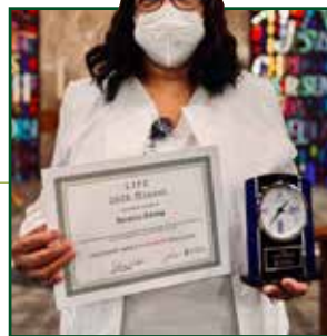
The Village at Anthony Boulevard