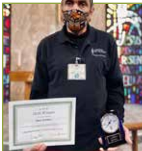
Residential & Administrative