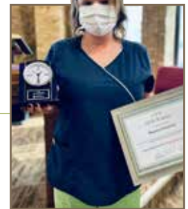
The Village at Kendallville